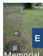
Memorial plaques for nuns