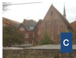
Convent Chapel; now part of OLA School