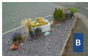
Amusing garden at start of Clevelands