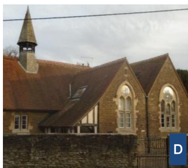
Old St Edmunds School; now the Parish Centre