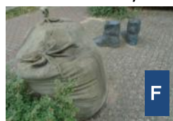
Curious sculptures in Penlon Place