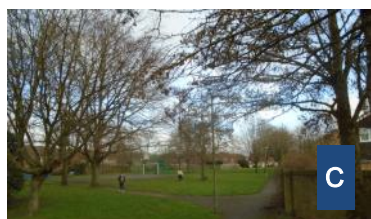
Elizabeth Avenue Play area