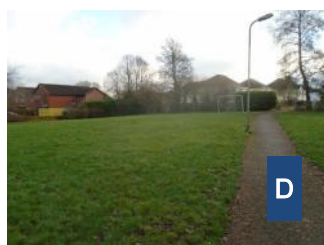
Play area off Norris Close