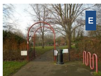
Peachcroft Park Play-ground