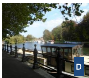
St Helen's Wharf