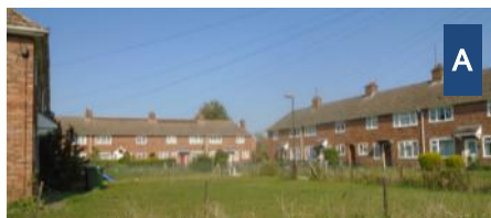
As you walk along Saxton Road, note the traffic free areas in front

Enjoy the views of the Thames, see the Alms Houses and walk the long interesting residential roads.