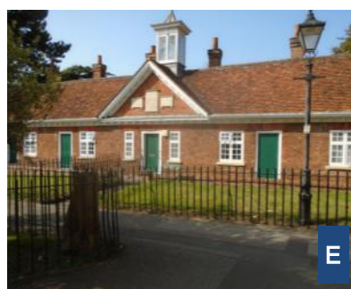
Twitty's Alms Houses