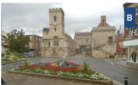
St Nicolas Church