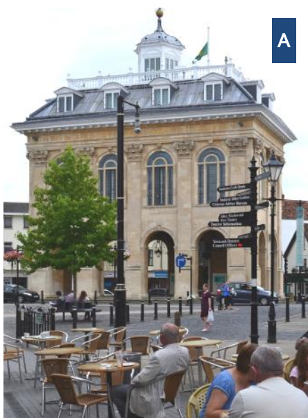
Old County Hall (now town museum) and market place

Short walk taking in many beautiful sights and views of the town.