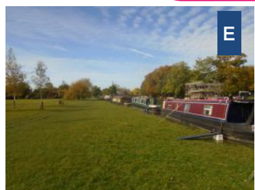
Rye Farm Meadow