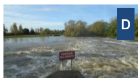
Rough water at weir