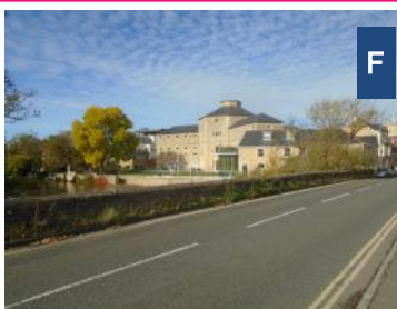
Abingdon Old Gaol from Bridge Street